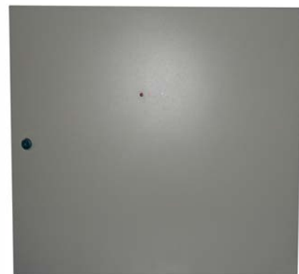
Power Supply Box

The GST 5000/8 is an intelligent fire alarm control panel. Wall mounted type housing it provides the perfect solution for all medium to large system by utilizing advance GST Protocol.